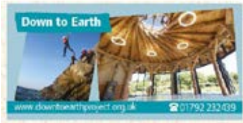
Standard layout example, quarter page